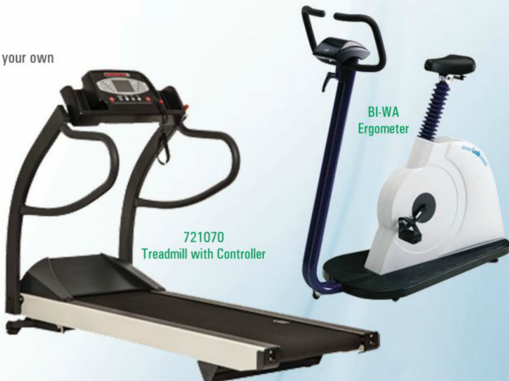
721070 Treadmill with Controller