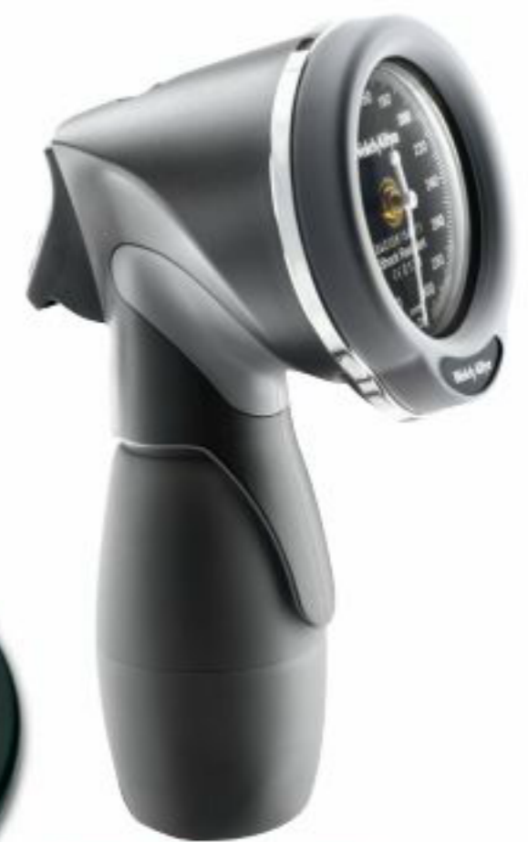
DS66 GOLD RANGE