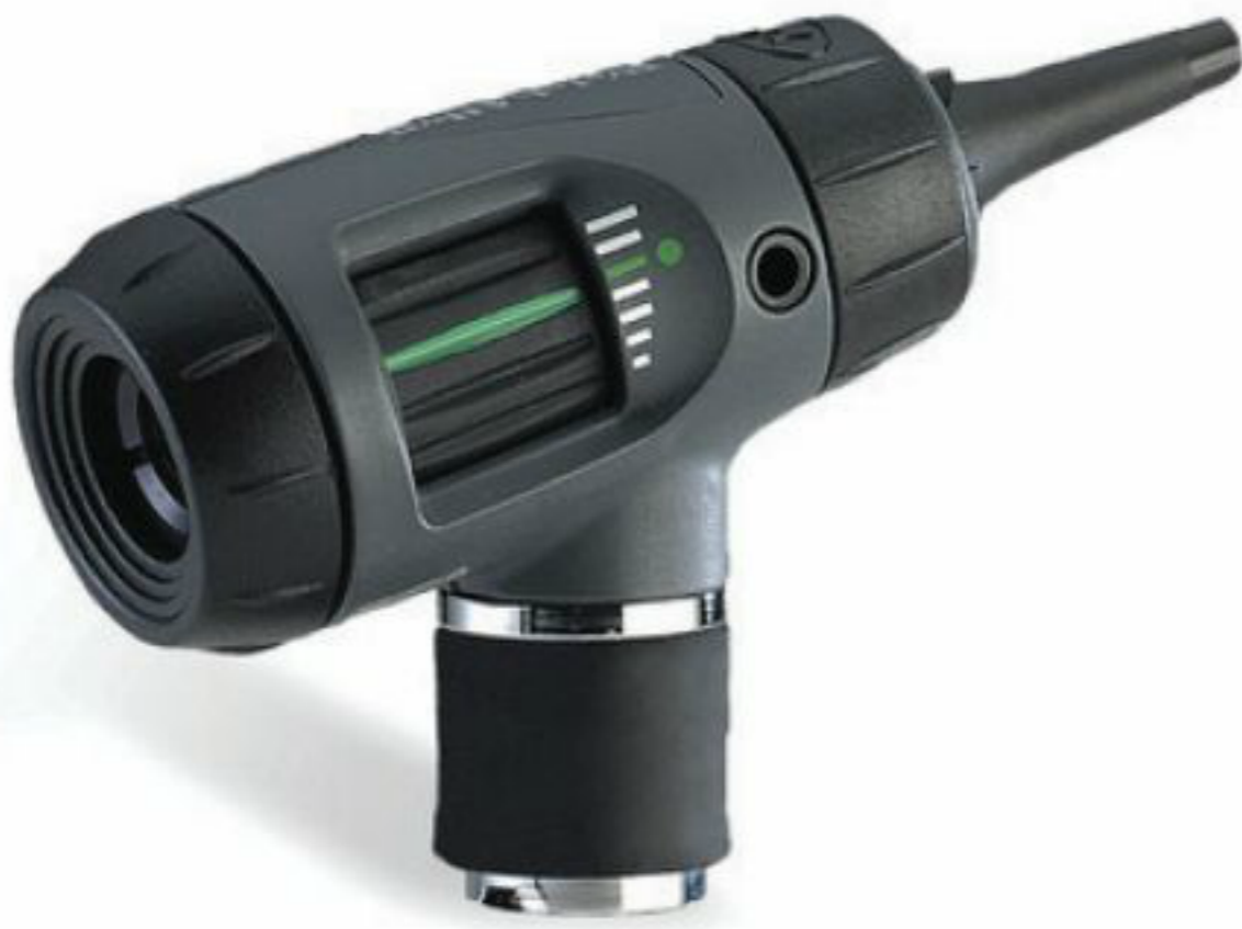
23820 / 23810