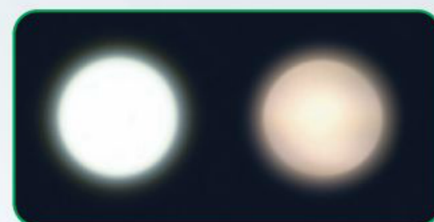
LED VS. HALOGEN