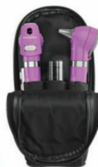
92871 - BLK or WHT or BLU or PUR