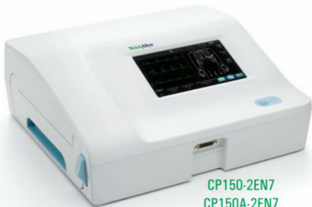
CP150-2EN7 CP150A-2EN7 INTERPRETATION