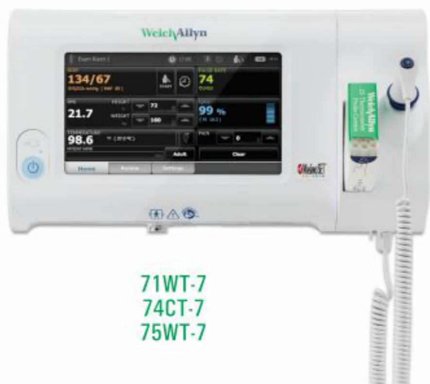
71WT-7 74CT-7 75WT-7