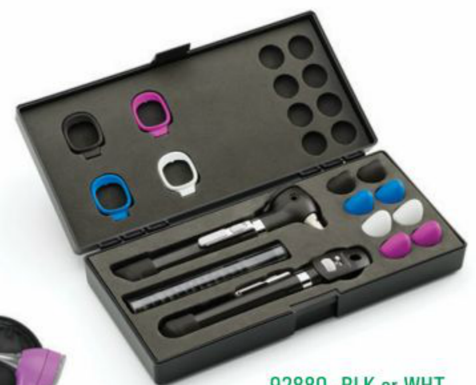
92880 - BLK or WHT or BLU or PUR